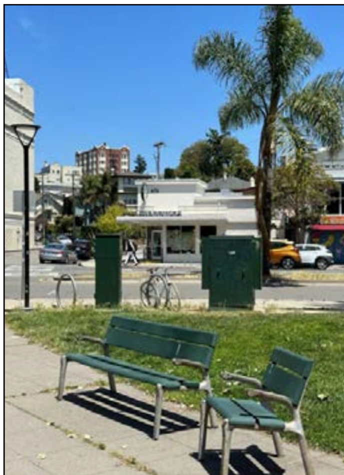
Figures 5 & 6: Images of the water fountain and fixed benches at Splash Pad Park