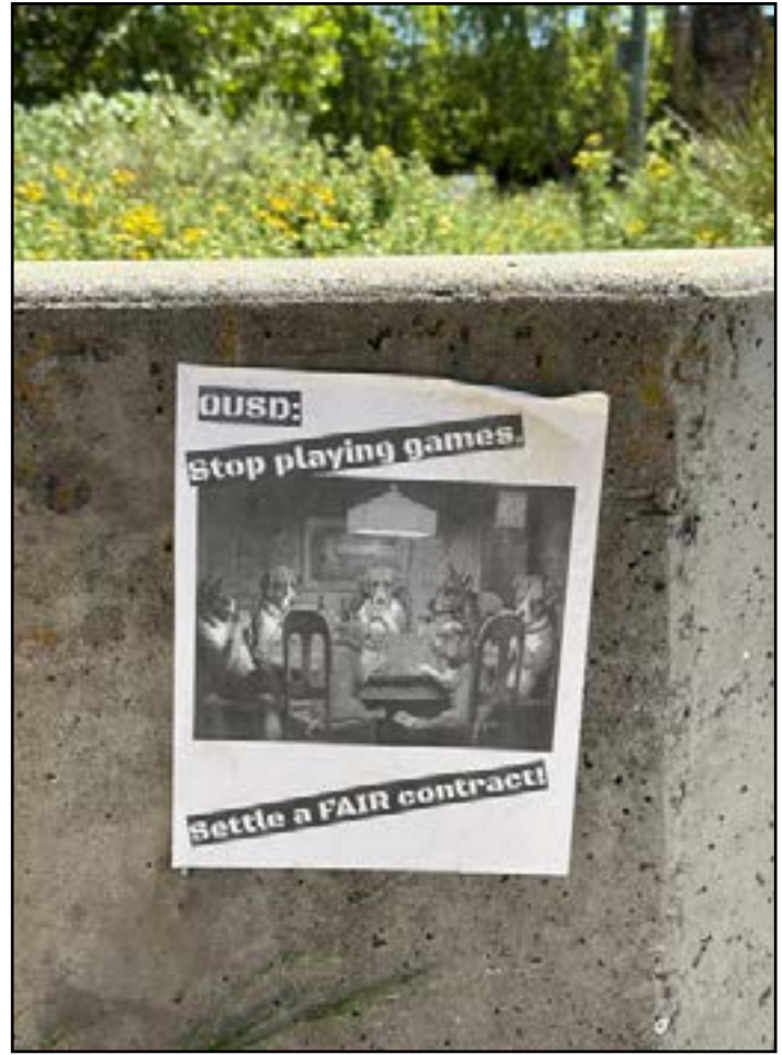
Figure 8: OUSD protest fliers posted around the park. By Chris Abeel.

Of the four times I visited Splash Pad Park for observation, one of the times was on a Saturday during the Grand Lake Farmer's Market. This is a time when the park is typically its busiest. Farmer's markets are intended to create a space full of potential where people of all backgrounds can come together and engage in the vibrant social interactions that Jacobs believed were essential for creating strong and healthy communities. The population I observed at Lake Merritt farmer's market was not incredibly diverse, with a majority of Caucasian or white-passing individuals, but with at least 20-30% of Asian or Hispanic individuals. The common age range of visitors was from 20 to early