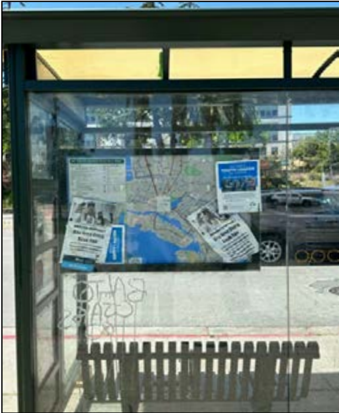
Figure 10: Fliers for book fairs and youth leader groups are shoved between a bus stop map and the glass so that community members can advertise businesses and events in the area.

fective step in the right direction. situated in this regularly unused portion of space in the center of the park. A mock-up to the right that I made crudely in a few minutes is an example of what it could look like in the park.