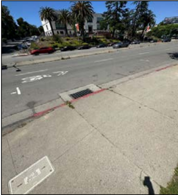
Figure 14: Sharrow on Grand Avenue

Figure 14 shows the Sharrow on Grand Avenue indicating to drivers that they have to share the road with Cyclists. Grand Avenue is a very busy multi-lane street that connects to the I-580 Freeway, and I can say from experience that biking along it is not a pleasant experience. In the photo above the gap between the red-painted curb is the driveway that vendors use to enter and setup for the farmer's market. That driveway connects to this paved road in Figure 15. By adding Sharrows to this road and adjusting the Oakland City Bike Route Map, this pathway could be an outlet for cyclists heading towards Lakeshore riding on Grand Avenue to cut through Splash Pad Park and enter onto Lake Park Avenue, a much slower and less populated road. This could prevent traffic collisions between cyclists and vehicles and also increase the use of the park on weekdays.