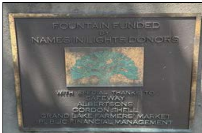
Figure 1: "Name of Lights" dedication plaque.

Three Years after initial planning began, the day finally came on October 20th, 2003 when the grand opening ceremony was held. The entire community, particularly the vendors and patrons of the weekly Farmers' Market who had been relocated to the parking lot under the freeway for a year during construction, gathered for a day in the sun for all. As the fountain was switched on, a horde of children rushed towards it, while speaker after speaker expressed awe at the weather and the turnout. They outdid each other with superlatives, praising the new park and the process that led to its creation.