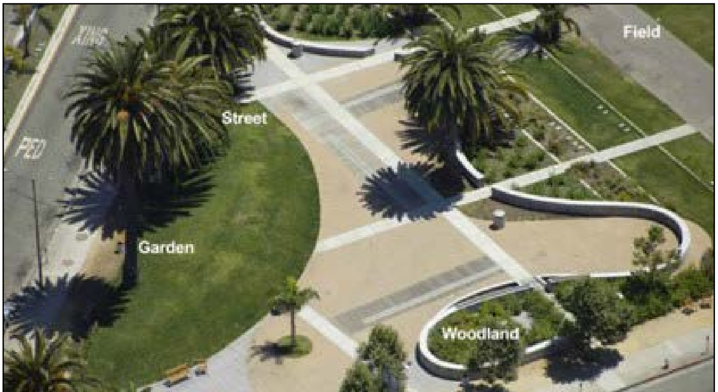
Figure 3: Image of Walter Hood's proposed design for Splash Pad Park