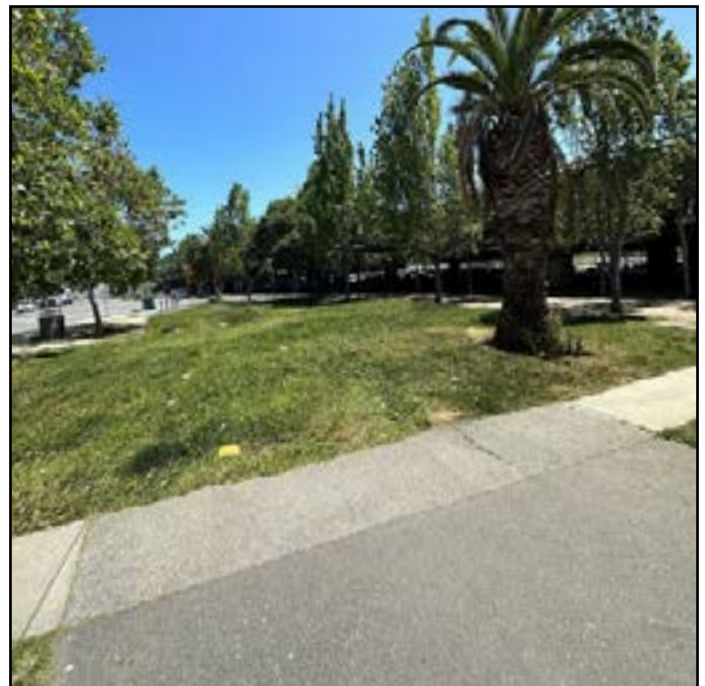
Figure 13: After, Authors mock-up of recommendation 3