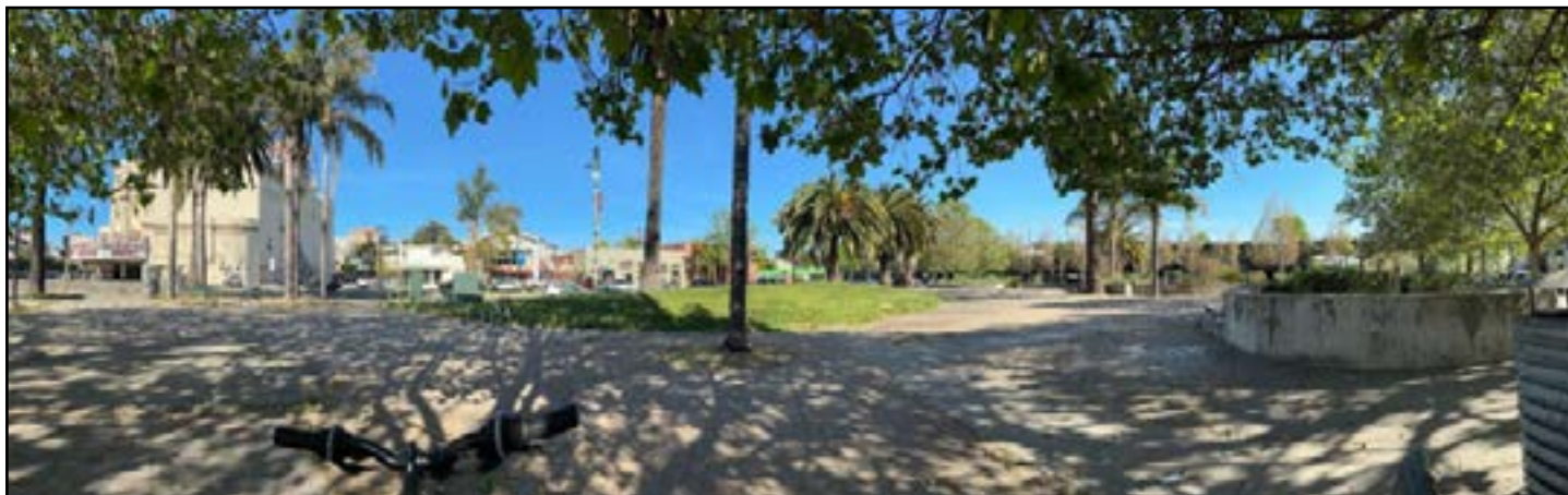
Figure 4: Image of Splash Pad Park

After the re-design in 2003 by architect Walter Hood, this patch of land got a complete facelift and is pretty aesthetically pleasing. The ground area is a mixture of green space, concrete, asphalt, gravel, wood, and metal. The organic environment of the park consists of palm trees, oak trees, common bushes and foliage, and planters of colorful flowers.