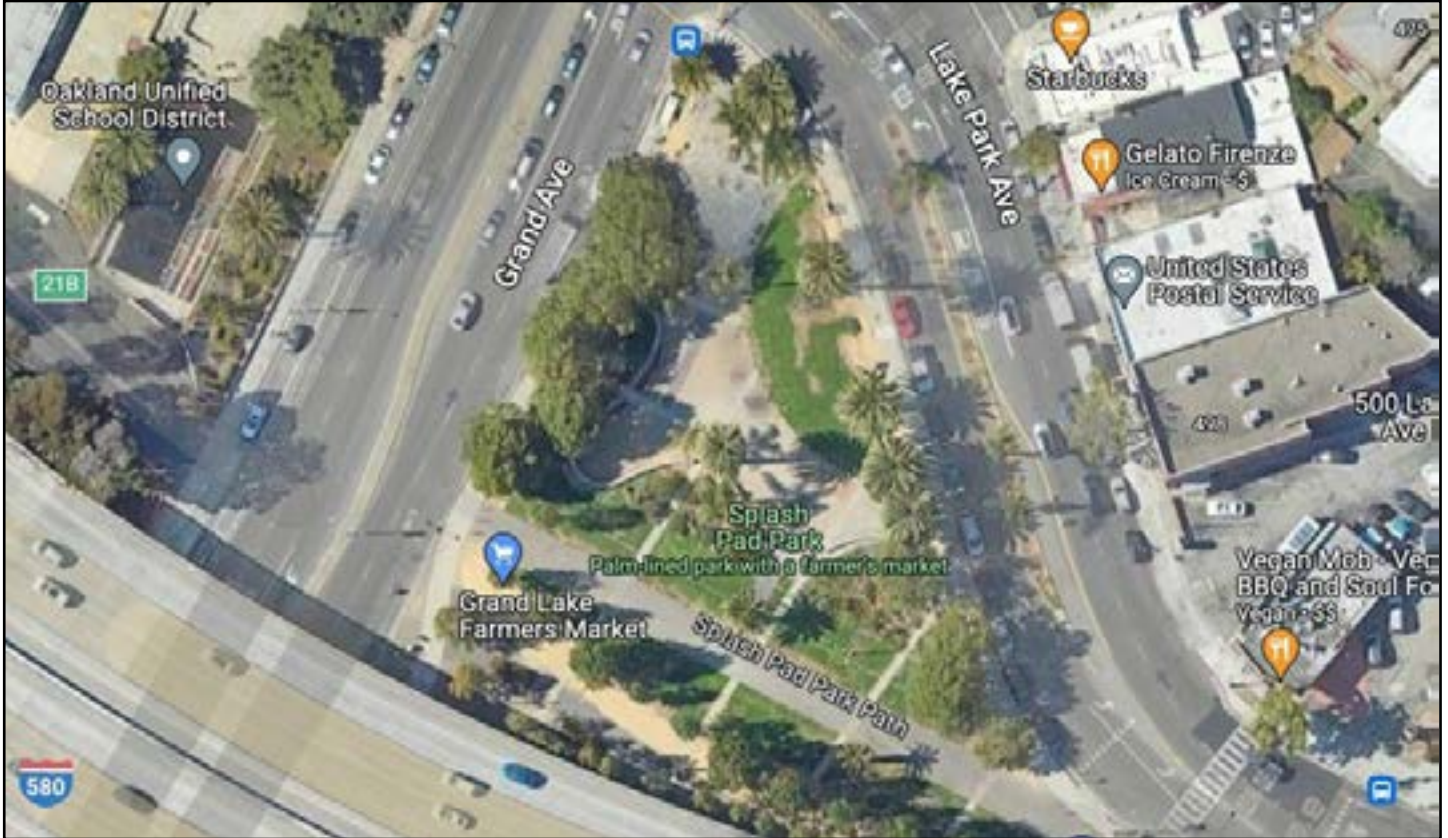
Figure 2: Google Satellite image of Splash Pad Park

Located at 746 Grand Ave in Oakland, California, Splash Pad Park is nestled between the intersection of Grand Avenue and Lakeshore Avenue and the I-580 overpass. The park has an area of roughly 5,200 square meters and is designed in a sort of right-angle triangle shape due to the sharp intersection between Grand Avenue and the I-580 freeway, with the northernmost edge of the park following the curved shape of Lake Park Avenue.