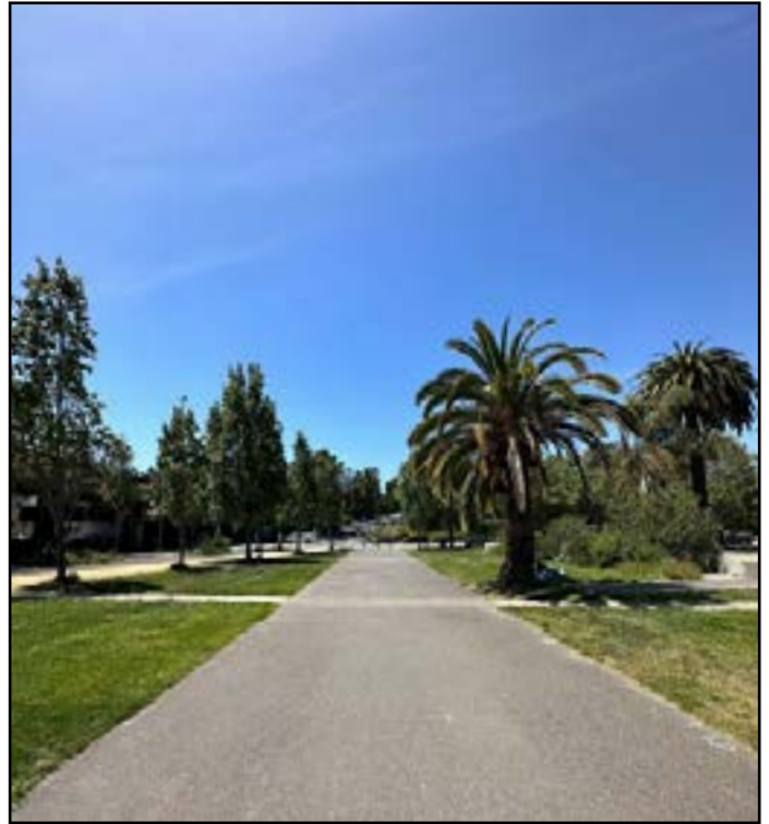
Figure 15: Driveway that connects to the paved road