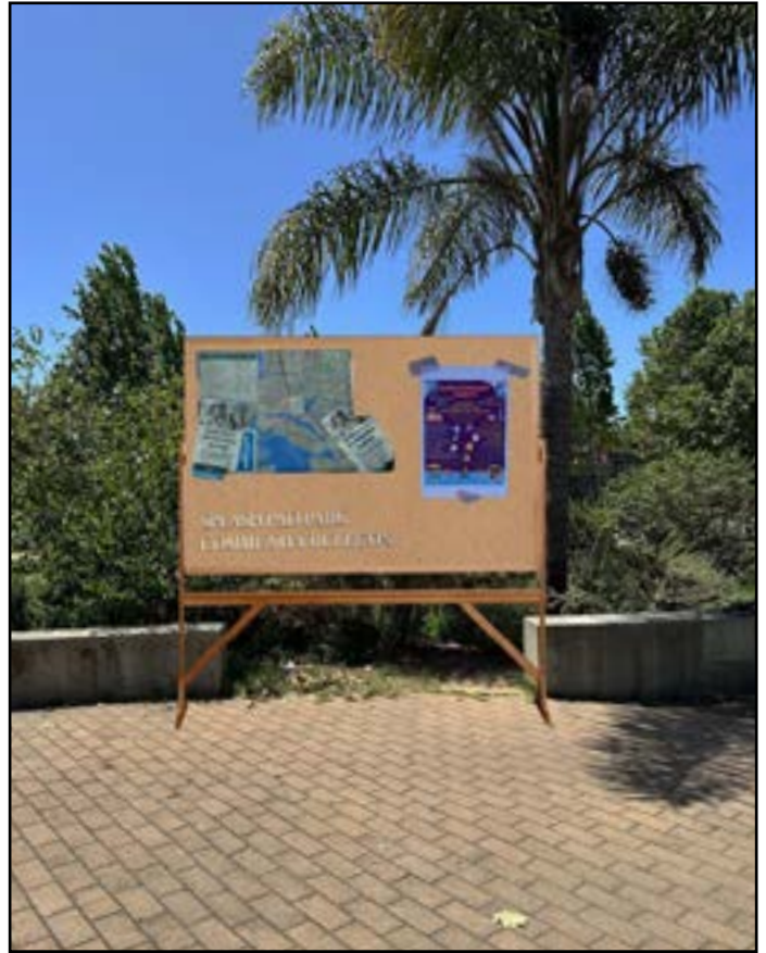
Figure 11: Authors mock-up of community board