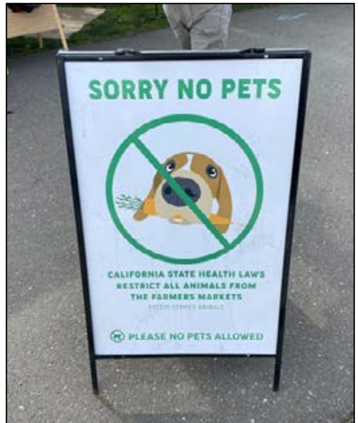
Figure 9: No Pets sign at Splash Pad Park

If the reasoning for this code is Sanitary for keeping the space clean the city could install Dog Bags and Dog trash cans as well as signs that encourage owners to clean up after their pets. This to me is a simple fix that could bring a lot of good to the park.