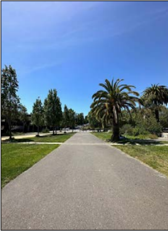
Figure 7: Roadway where weekly Farmers Market is held at Splash Pad Park by Chris Abeel.

This section of the park is where the weekly Farmer's Market is held, as you can see by the large roadways of asphalt through the greenspace for trucks to drive through and set up their stalls. This space has little to offer, no coverage from the sun, and no public seating. This area is the largest fault of Splash Pad Park. This area has no bike lanes, no trash cans, and dogs are not allowed.