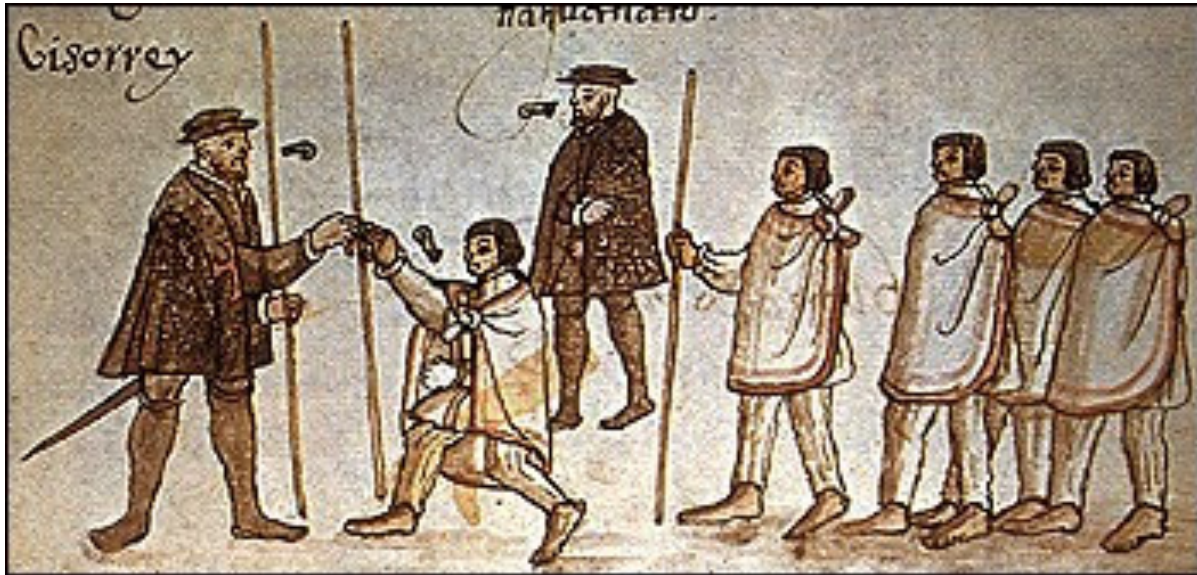
Figure 1: image of indigenous submitting to encomienda labor requirements taken from Francisco Cabezo's "The denunciation of the encomienda and the arrival of black slavery in America". (7, September 2014). Accessed May 1, 2018. http://queaprendemoshoy.com/la-denuncia-de-la-encomienda-y-la-llegada-de-la-esclavitud-negra-a-america/ .

Many of these encomiendas were on lands formerly held by indigenous local lords, or tlatoani , and bordered by altepetl that had managed to retain control of their community land in the aftermath of the conquest. The 16th century saw these new landowning Spanish begin to utilize their preferential status in relation to the indigenous to envelop more and more native land into their own private holdings, land and tribute privileges which had once belonged to indigenous elites. The King soon took notice of the vast wealth being accumulated by these conquistadors and initiated a series of reforms in New Spain that included the replacement of the now corrupt and encomendero -aligned audencia , the Spanish royal court in the Americas. The new audencia signaled to the affected Altepetl the opportunity to defend their landed interests was upon them.