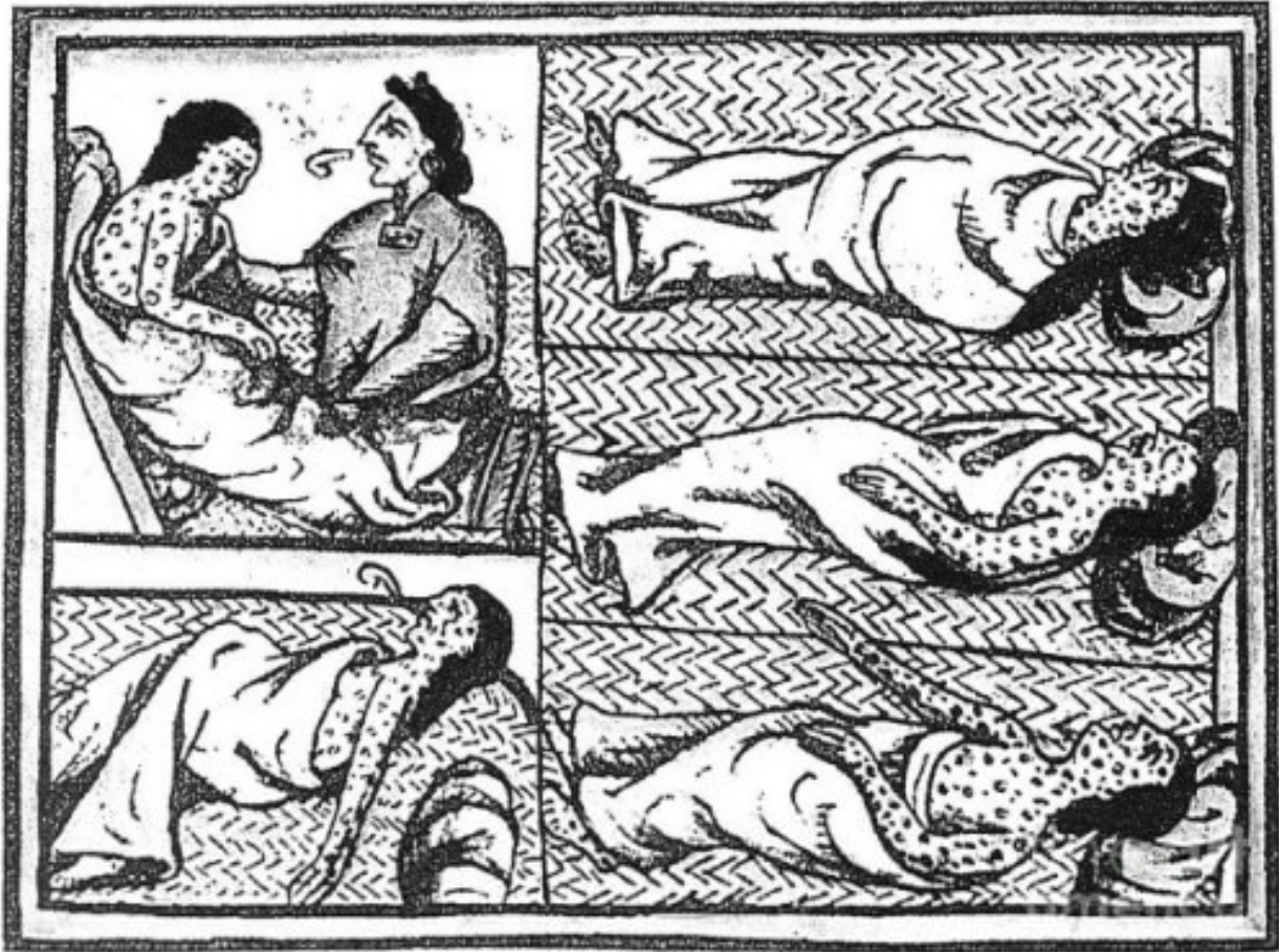
Figure 5: indigenous art depicting altepetl members dying of plague taken from “Fray Bernardino de Sahagún, Florentine Codex (1529)” accessed May 1, 2018. http://brockuhistory.ca/ebooks/hist2f90/media/fray-bernardino-de-sahagn-florentine-codex-1529 .

outlining the impact on land procedures that the massive population loss entailed. Kelly McDonough describes how the native people of Central Mexico obliged the Spanish in accepting forced relocation: “It is illness, the dreaded cocoliztli (plague), that is suggested as the primary reason for accepting congregacion ; since so few survived it was to everyone’s benefit that those in the more decimated communities left their former lands to join other peoples.”[4]