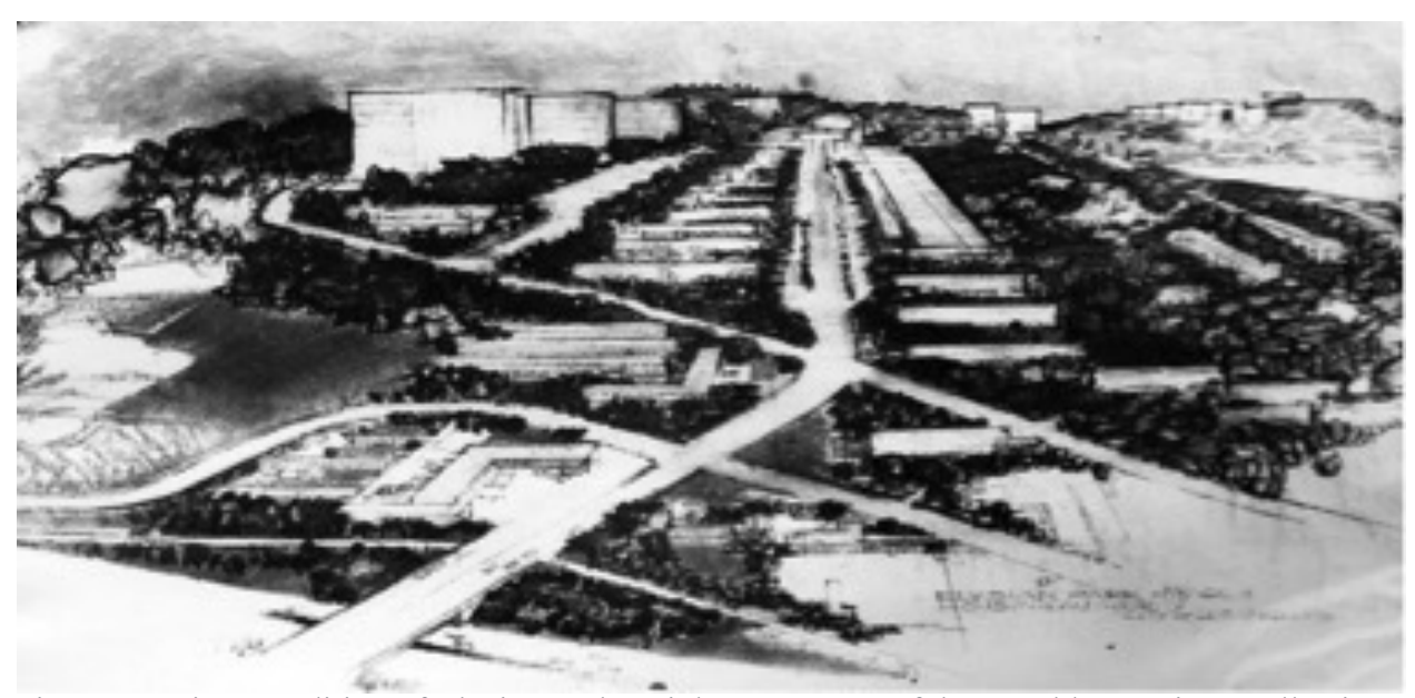
Figure 2 Artist's rendition of Elysian Park Heights. Courtesy of the Herald-Examiner Collection, Los Angeles Public Library

Upon physically visiting Chavez Ravine itself, Alexander and Neutra felt even less cohesion with the project when they observed the orchards and vegetable gardens in wide open spaces and single family dwellings that were not as bad as had been conveyed by the CHA's assessment of the area[15]. It was apparent to the would be creative minds of the proposed project that the community of the Chavez Ravine area, though dubbed to be dilapidated and rural by the building codes and standards at that time, was still a healthier environment for families to live and grow up than a cramped and crowded apartment building, lacking open spaces, home-grown and natural vegetation, and clean fresh air.