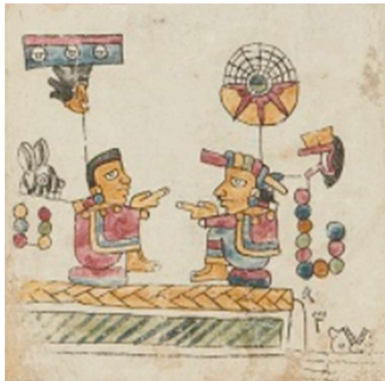
Figure 2: Image of the yuhuitayu from the Codex Becker II reproduced from Kevin Terraciano. page 166. From Museum für Völkerkunde, Wien.

The New Philology methodology continued to be implemented into other scholarship in Mexico. Kevin Terraciano examined Oaxaca, specifically the Ñudzahui people (also known as the Mixtec), thoroughly through native-language research in the book The Mixtecs of Colonial Oaxaca: Ñudzahui History, Sixteenth through Eighteenth Centuries . 11 Unlike the Nahuatl and the Maya, the Ñudzahui political structure represented gender parallelism, a joint rule of a male and female lord called the yuhuitayu , as demonstrated in Figure 2. The yuhuitayu also represented the most populated political centers in Ñudzahui territory, as evident in indigenous documentation from the Oaxaca archives. 12