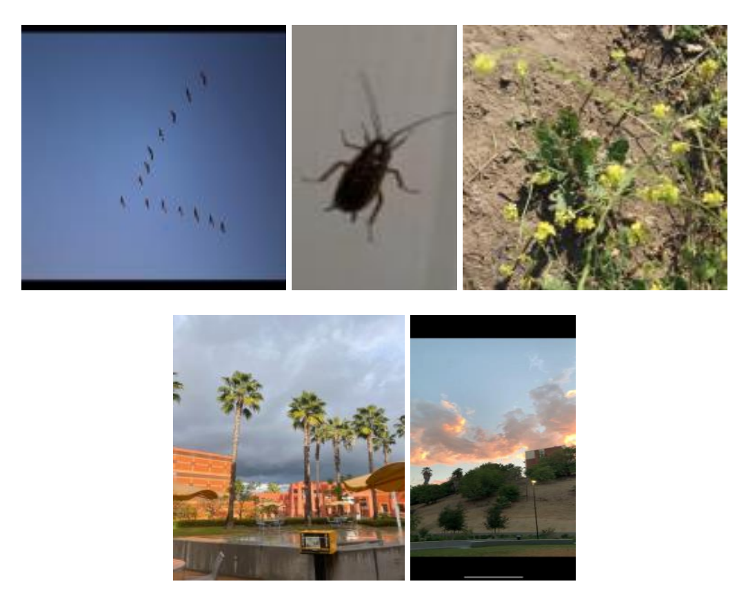
The Nature of My Neighborhood

This assignment made me rethink what I consider as nature. Nature doesn't have to be a big, vast, open space but can be found anywhere.