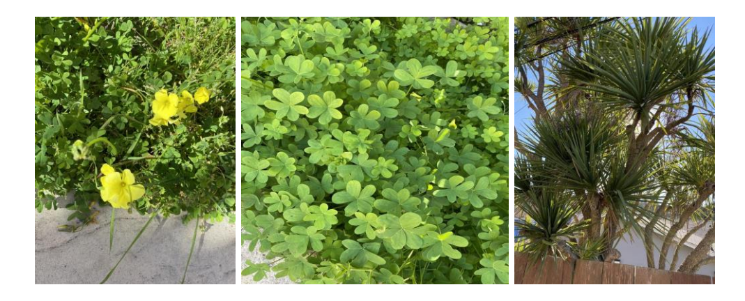
The Nature of My Neighborhood