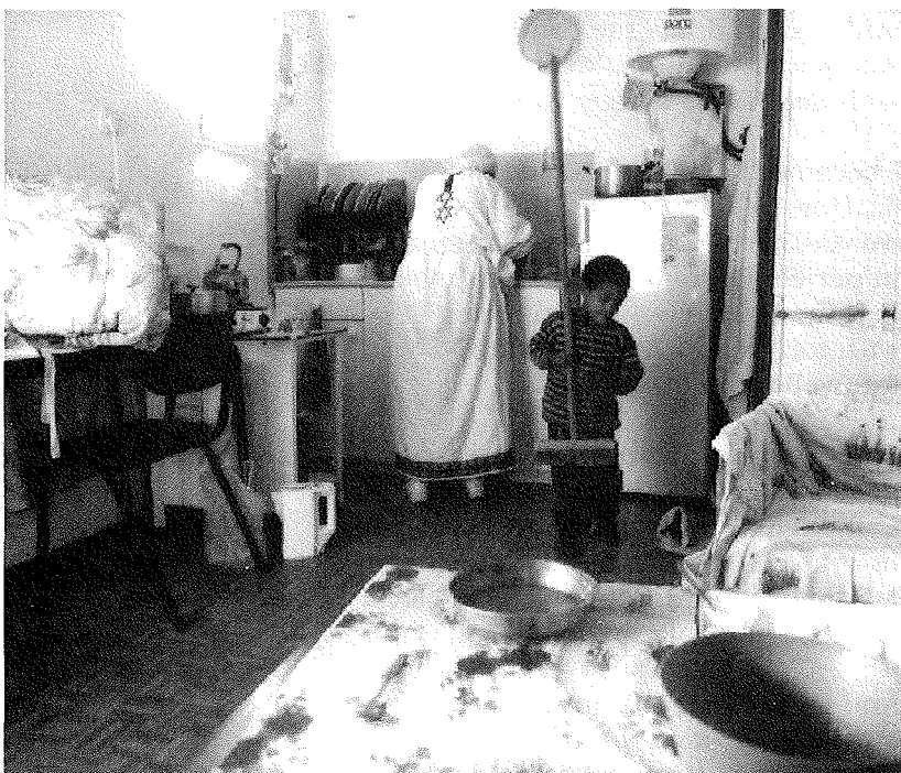
Givat Hamatos, Israel

A photo essay is a group of images that evoke a narrative response from the viewer.