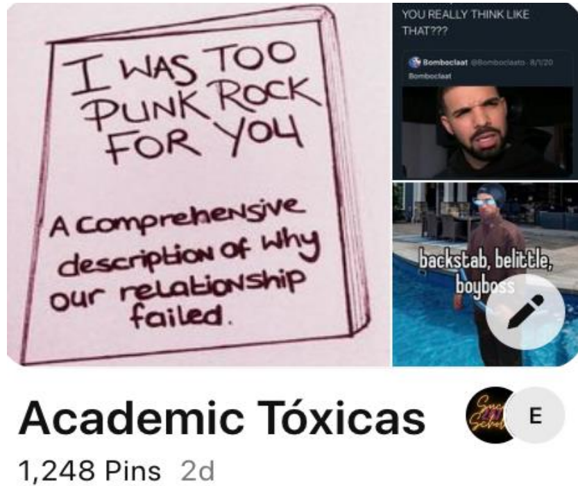
Figure 4. (Pantoja Perez, 2022)

Though the authors funneled their rage into different creative mediums, we both came to terms with our susceptibility to the academic seduction of belonging. In acknowledging our vulnerabilities, we implicate ourselves as accomplices in our own oppression. We sought out in others what we felt that we lacked in experience, credibility, and influence. Only after admitting to the problem, were we able to view ourselves as powerful and capable of standing on our own two feet as creators whose individual and collaborative work holds credence. As such, we move away from the DAP insecurities that lend themselves to seduction towards consensual and pleasurable WAP connections with future collaborators.