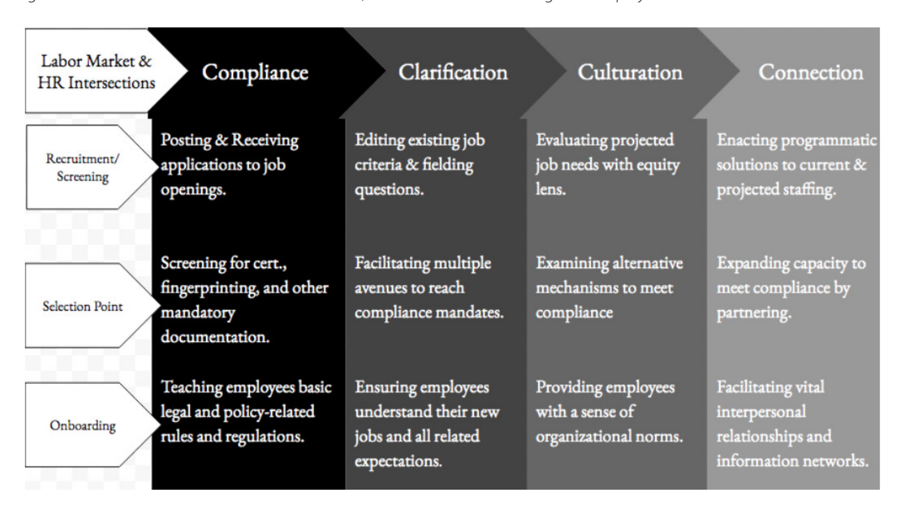
Figure 1: 4 C's of Human Resources in Recruitment, Selection and Onboarding New Employees

Adapted from Bauer, T. (2004). Onboarding New Employees: Maximizing Success. SHRM Publications