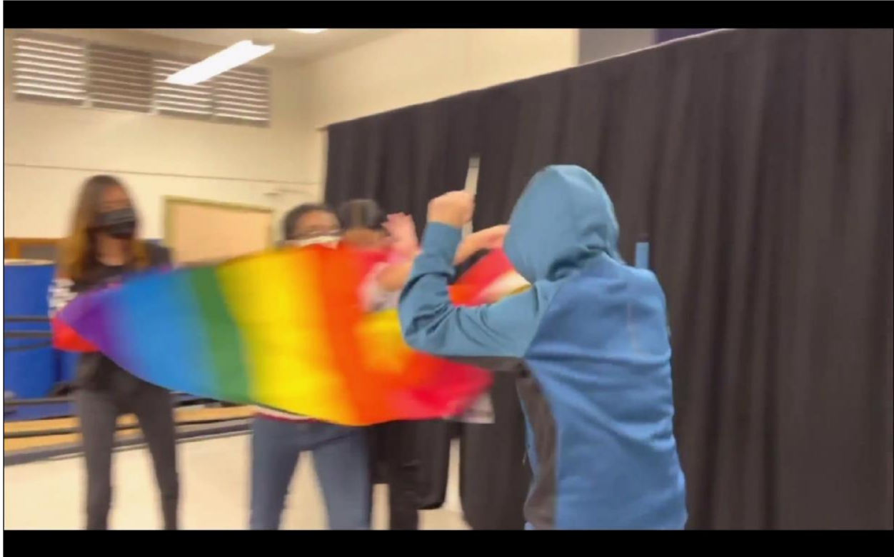
A scene from Our Legacy .