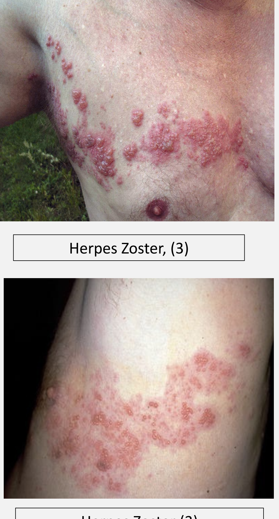
Herpes Zoster (3)