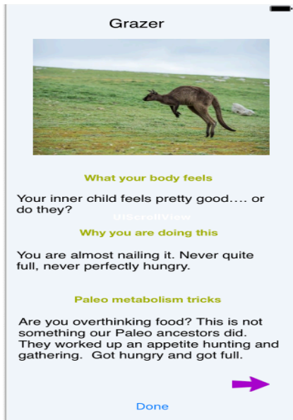
Figure 3. Example of Feedback for a “Grazer.”

The more times the user engages in feedback, the better they become at recognizing hunger and fullness, and the better they will get at eating intuitively, leading to sustainable behavior change. Depending on how hungry or full users feel surrounding each meal, typical cues for their behaviors are also part of the feedback, along with the diagnosis, as well as targeted specific tips on how to eat more mindfully by listening to interoceptive cues of hunger and fullness. The implicit and explicit goal of the app is to gain the diagnosis of “Intuitive Eater” a majority of times.