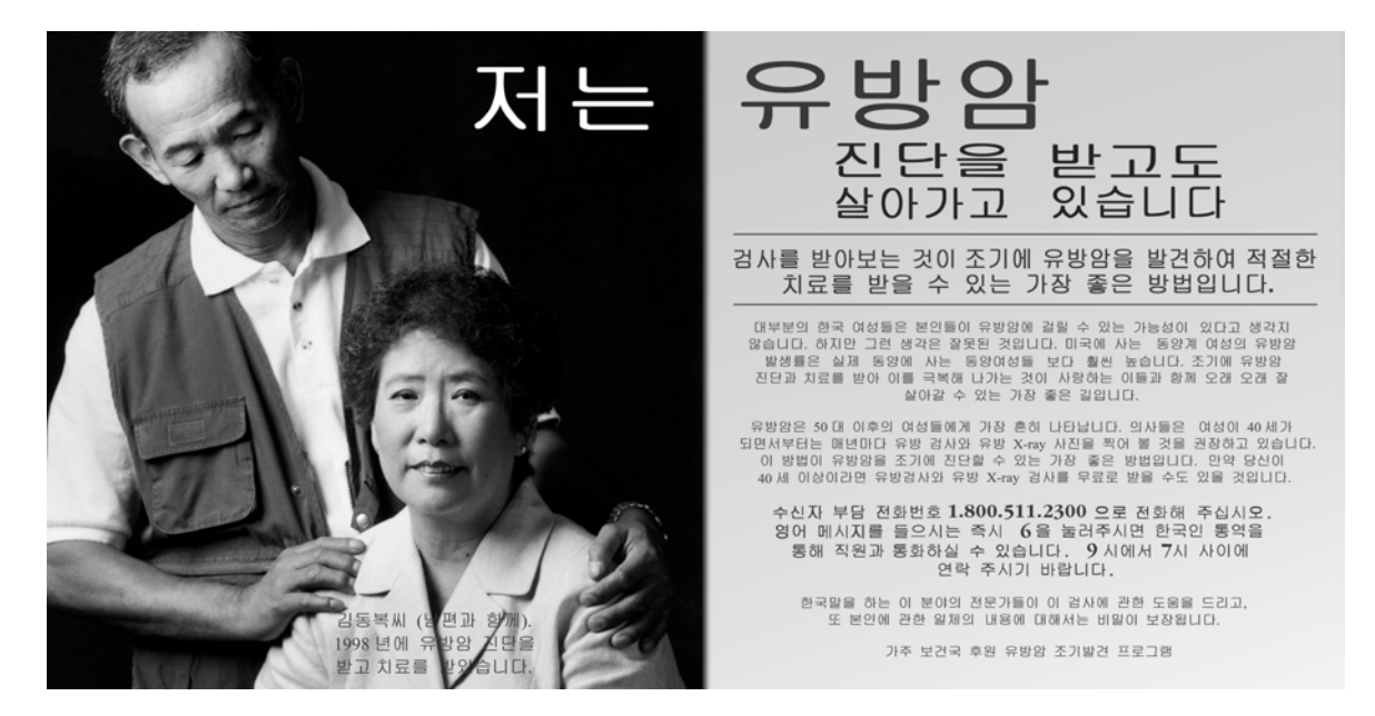
Figure 2 Breast Cancer Early Detection Program (BCEDP) Poster in Korean