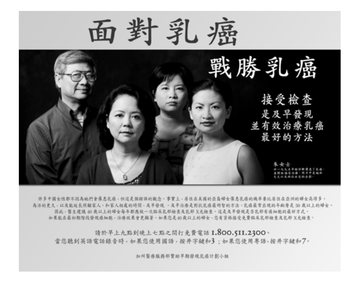
Figure 1 Breast Cancer Early Detection Program (BCEDP) Poster in Chinese