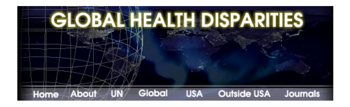
Figure 2 Final Global Health Disparities CD-ROM Header