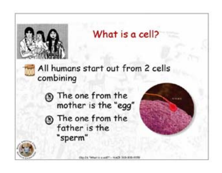
Figure 1 Excerpt from GENA® objective 26

vegetables), small bubble wrap, clear liquid soap, and small beads.